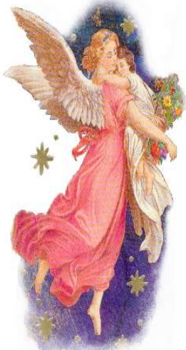
And He Will Raise You Up On Eagle's Wings...

For those who have suffered the loss of a child of any age through miscarriage, still-birth, abortion, SIDS, illness, overdose, suicide, disease or any untimely death.