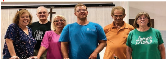
Some of our Bingo Team Volunteers