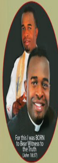
For this I was BORN to Bear Witness to the Truth (John 18:37)