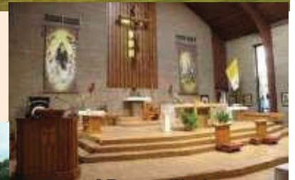
Rite of Reconciliation Saturdays: 3:45 p.m. or anytime by appointment