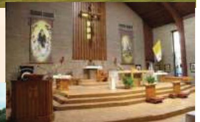
Rite of Reconciliation Saturdays: 3:45 p.m. or anytime by appointment.