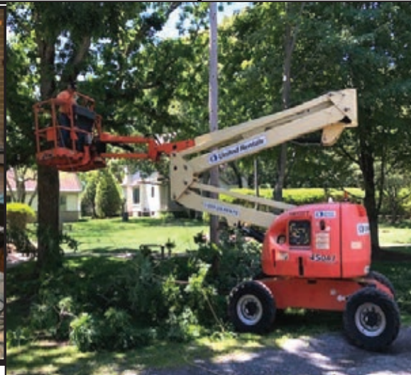
Trimming the trees in the Garden that block the overhead lights.