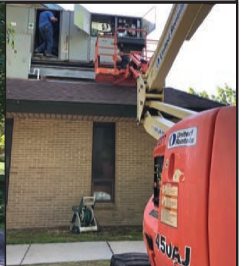
Getting church air-conditioning ready for summer.