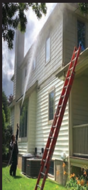
Power washing the Rectory and Parish Office.