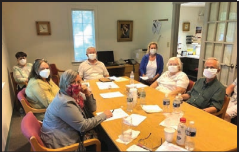
Team meeting in the dugout to help set up Church with COVID-19 guidelines.