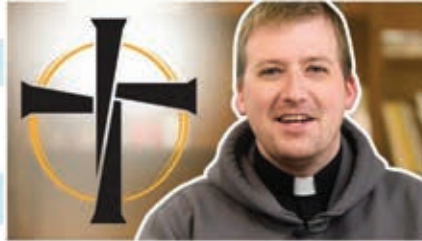
How to Become a Priest