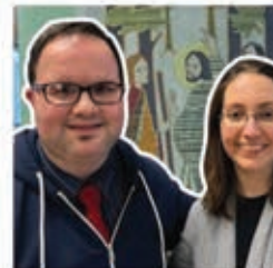
Finding inspiration in our saints