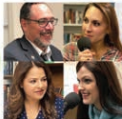
Interviews with great Catholics