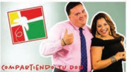
Temas locales para la Comunidad Hispana