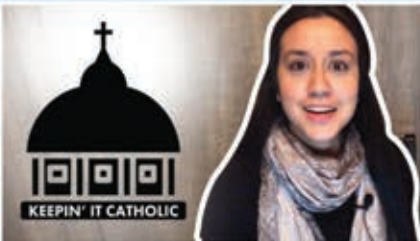
A Perspective for Young Adults