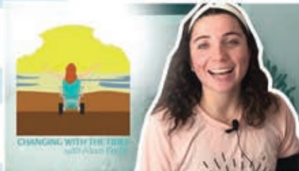
When Life Gives You Lemons