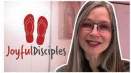
Become a Missionary Disciple