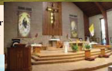
Rite of Reconciliation Saturdays: 3:45 p.m. or anytime by appointment.