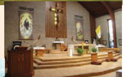
Rite of Reconciliation Saturdays: 3:45 p.m. or anytime by appointment