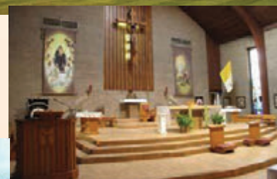
Rite of Reconciliation Saturdays: 3:45 p.m. or anytime by appointment